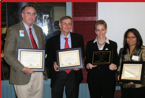
Pictures from our Physicians Forum on Parkinson Disease in Salado on November 2, 2007.

What a way to nourish your bodies and vocal cords at the same time, and to combat anxiety and depression that can come with the holidays. Even if you don't go caroling, when you sing "Jingle Bells" or "Rudolph the Red-Nosed Reindeer" with your grand-kids (or any other kids in your life), belt it out lustily!